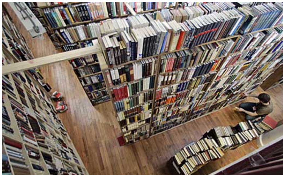
Khnko Aper Children's Library in Yerevan